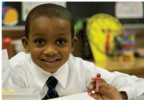
10 YEARS: 10 Million Dollars